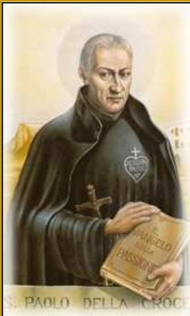
St. Paul of the Cross 1694-1775

May the Passion of Jesus be always in our hearts